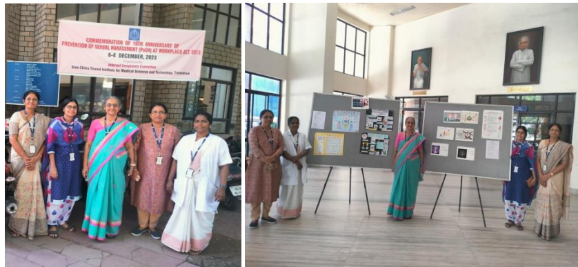
Pic 1 Banner and posters at AMC

The 10 th anniversary of the enactment of the PoSH Act 2013 was commemorated in an abefitting way at Sree Chitra Tirunal Institute for Medical Sciences and Technology (SCTIMST). This time to mark the important occasion we had a three day programme that reached out to senior staff and engaged them in a panel discussion, educated the new and junior staff by giving talks by external faculty both at BMT wing and Hospital wing with Achutha Menon Centre(AMC). The last day was a valedictory function with a talk by a woman leader that was intended to inspire the upcoming generation of women to fearlessly pursue their chosen path. This was presided over by the Director .