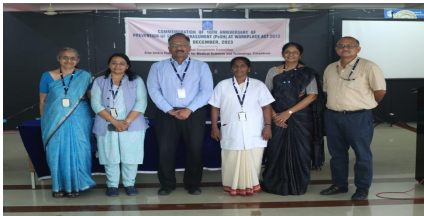
Members of the ICC are grateful to all staff and students who supported the events.